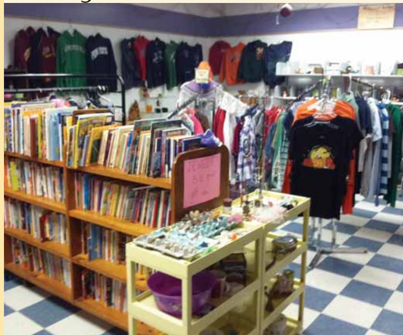
Thrifty Threads, Linntown Elementary, is now open for business! Please consider donating your gently worn clothing, knickknacks, stuffed animals and jewelry.