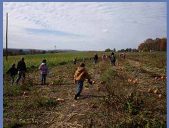
Pumpkin patch First grade field trip