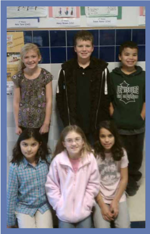
Fourth- and fifth-grade anti-bullying poster contest winners.