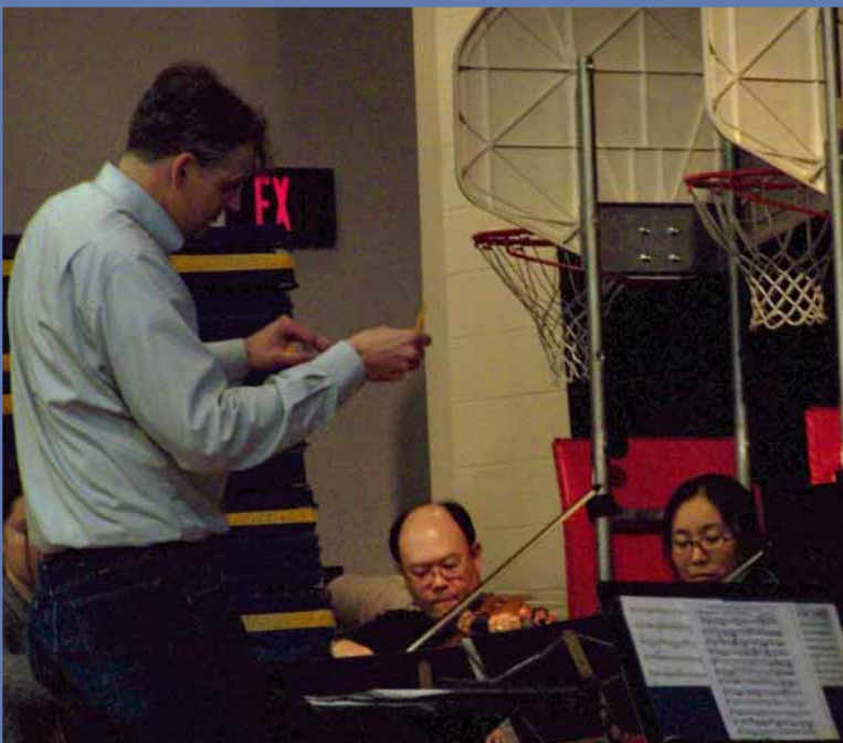
Paragon Ragtime Orchestra